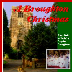
Above: The church's new phoenix organ and one of the Choir's many recorded CDs